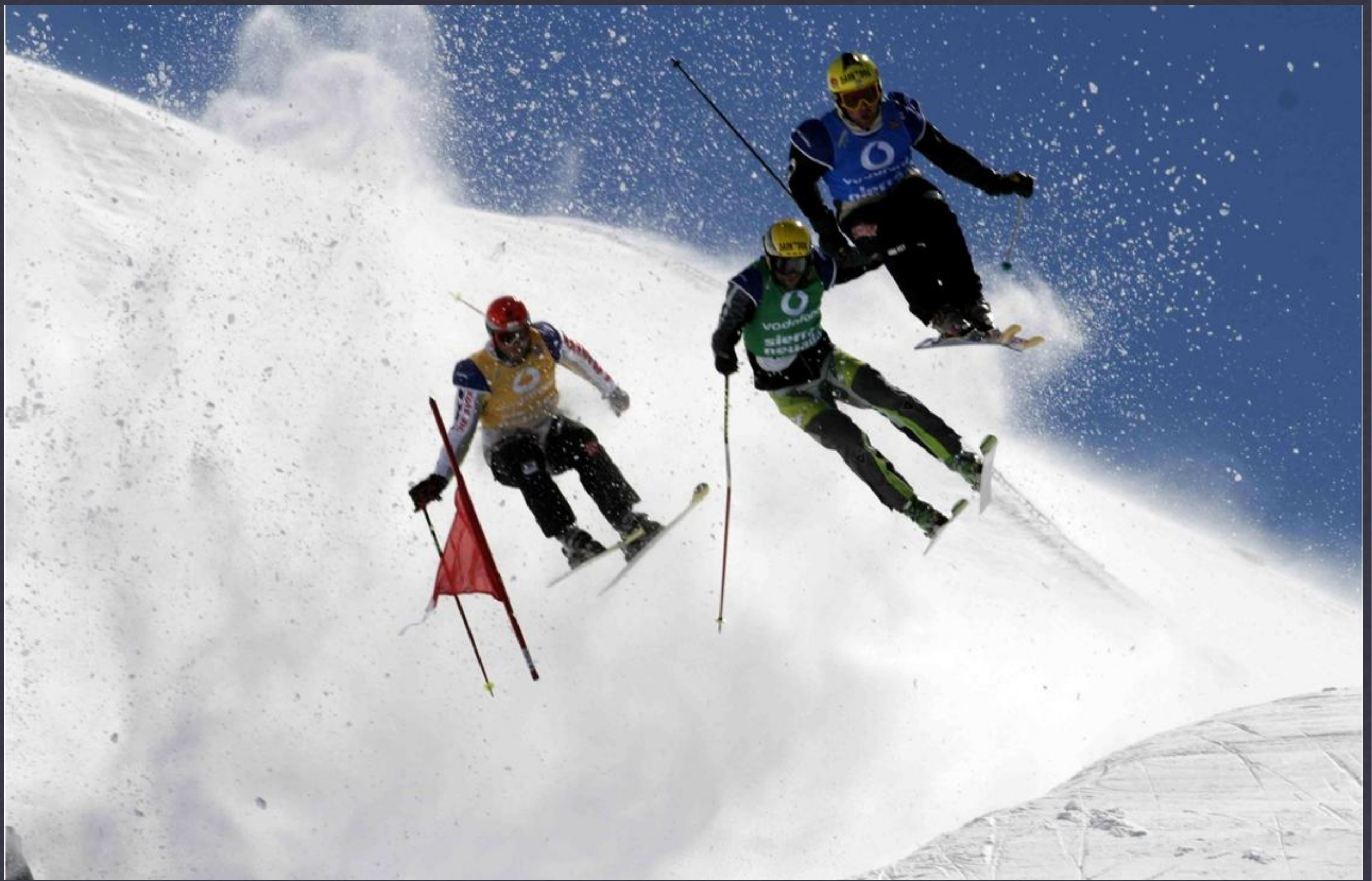
ski cross race format