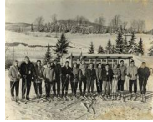
QUEBEC SKI HISTORY

Alpine Canada was founded as the Canadian Amateur Ski Association on December 20, 1920. To kick off our 100 th anniversary season, Alpine Canada will be hosting a gala with the “who’s-who” of skiing, including incredible national team alumni. This high-energy gala will be your opportunity to give back, support and meet all of the inspiring members of the 2019-2020 Canadian alpine, para-alpine, and ski cross teams.