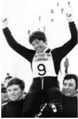
NANCY GREENE RAINE