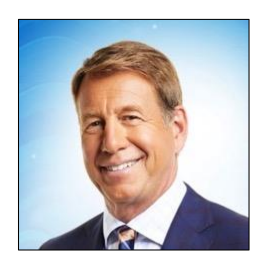
SCOTT RUSSELL Sports writer and broadcaster Host of CBC Sports' Road to the Olympic Games