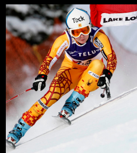
Kelly VanderBeek, Development team (2001-2004)