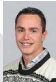
Erik Guay Mont-Tremblant, Que.