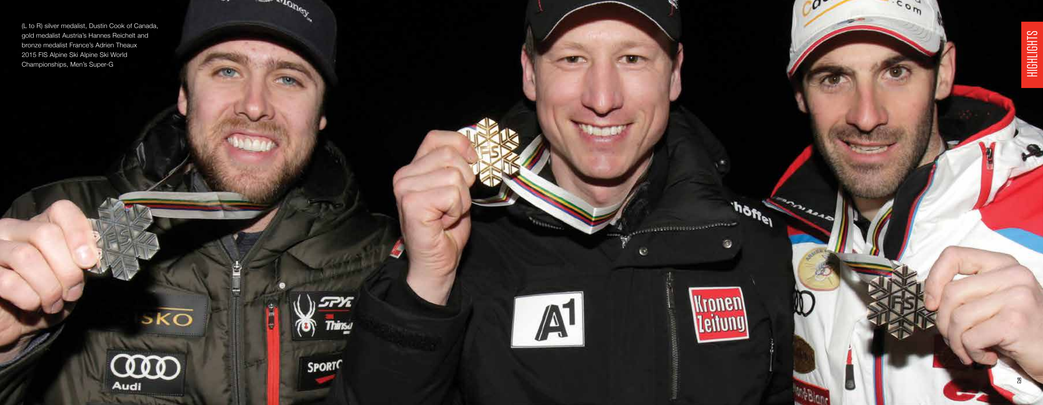
(L to R) silver medalist, Dustin Cook of Canada, gold medalist Austria's Hannes Reichelt and bronze medalist France's Adrien Theaux 2015 FIS Alpine Ski Alpine Ski World Championships, Men's Super-G