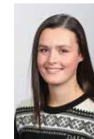
Marielle Thompson Whistler, B.C.