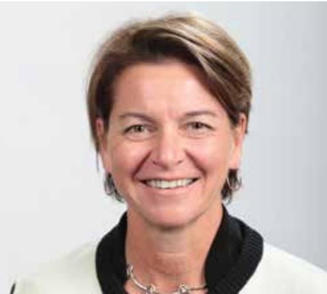
Martha Hall Findlay Director, Toronto