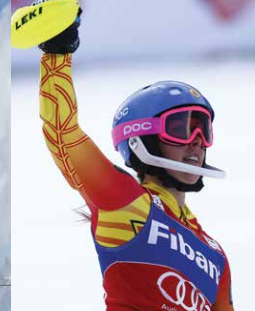
Marie-Michèle Gagnon