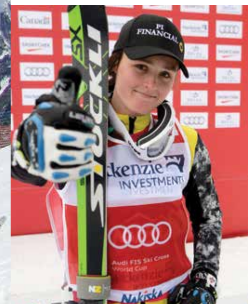
Marielle Thompson

Alpine Canada Alpin is the national governing body for alpine, para-alpine and ski cross racing in Canada, developing Olympic, Paralympic, World Championship and World Cup medalists.