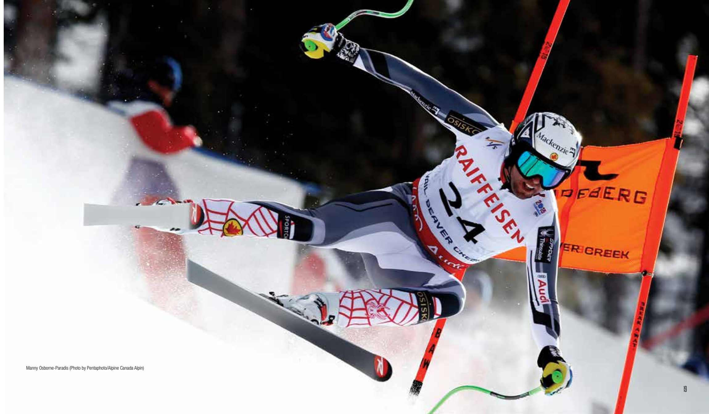
Manny Osborne-Paradis

It was a season to remember, as we proudly reflect upon the tremendous athletic achievements across all three of our teams. From Team Canada stunning the world at the 2015 FIS Alpine World Ski Championships with two podium finishes, to winning the coveted Crystal Globe in para-alpine, Alpine Canada Alpin athletes gave our fans, stakeholders and supporters a reason to BELIEVE!